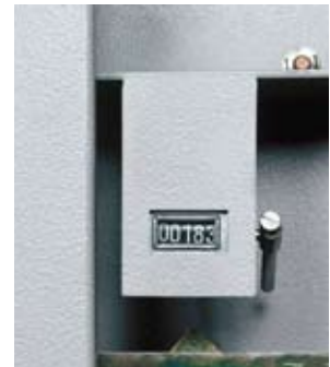
An optional counter means you can check if someone has accessed the cabinet.